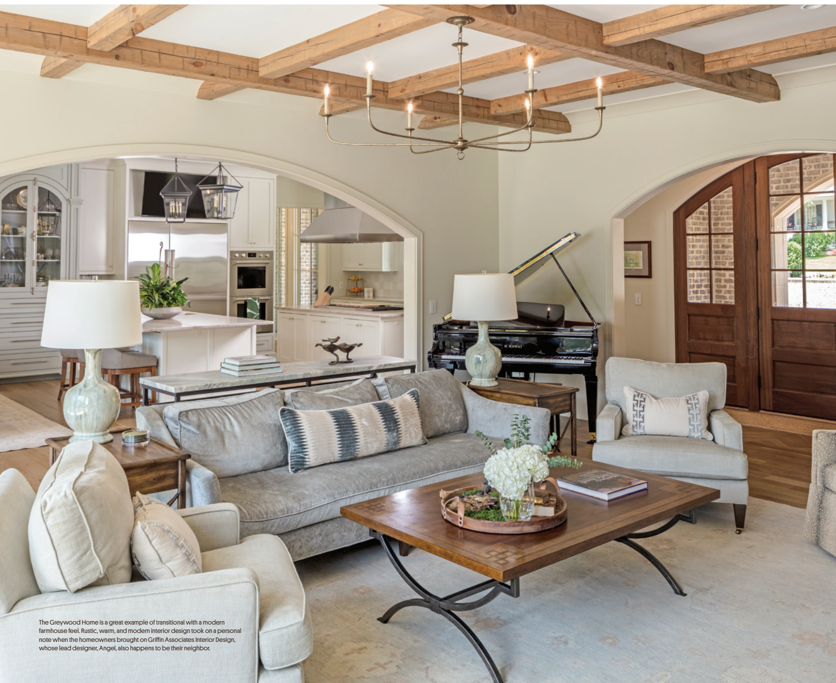
The Greywood Home is a great example of transitional with a modern farmhouse feel. Rustic, warm, and modern interior design took on a personal note when the homeowners brought on Griffin Associates Interior Design, whose lead designer, Angel, also happens to be their neighbor.

The view is only matched by the level of personal details that bring both beauty and functionality. A light-filled layout allows the house to melt into the surrounding landscape; custom laundry room features are designed to celebrate the owners' dogs; and a gem-like office is a true captain's seat, commanding a 180-degree view of the golf course.